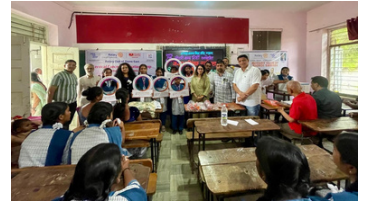
Inter-District Cervical Cancer Vaccination Project in Thane and Shirdi