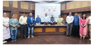
Project Nikshay Mitra, an initiative inspired by our Hon'ble Prime Minister to support TB patients - Rotary Clubs from RID 3142 joined hands with TMC