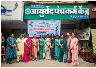
Papsmear screening event for women in Ghantali area