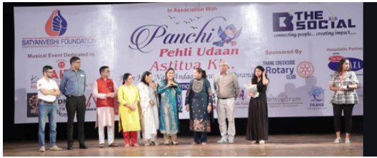
Fund raiser with Satyanveshi Foundation - Awareness about Thalassemia