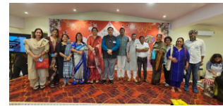
Festive Fusion Expo & Navdurga Conclave