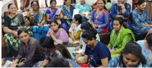
AI workshop for women