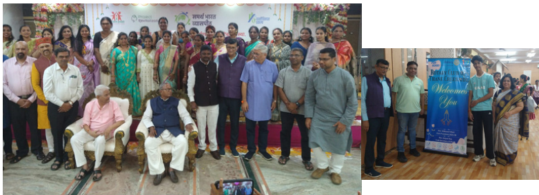
Samarth Sammelan and Diwali celebration