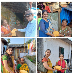
"Ek faral premacha", Diwali donations at Yeoor for children & tribal families with Ummeed social and educational trust