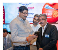
Silver Sponsor at Daan MUDITA TRF Seminar