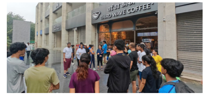
BT Run with Rotaractors