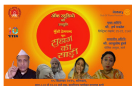
Suhaag ki Saadi play sponsorship